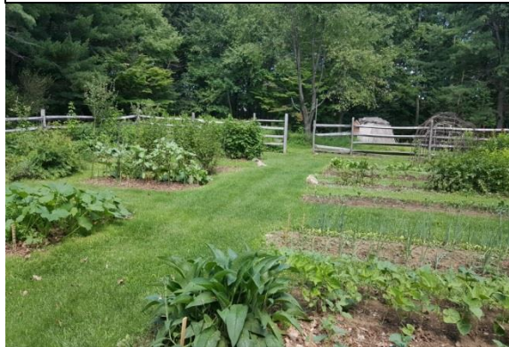
The heritage garden in the summer

The house is open for tours Thursday through Monday from May to October. Grounds are open to the public for free year round. For hours and list of programs and events, please visit www.bidwellhousemuseum.org 100 Art School Road, Monterey MA 01245 (413) 528-6888 or bidwellhouse@gmail.com