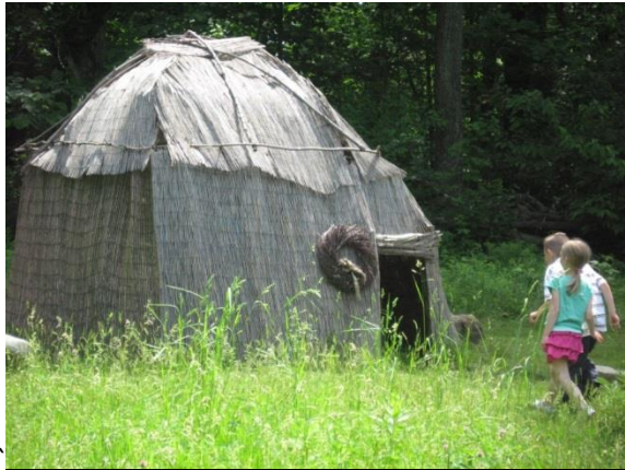
School Children explore the wigwam on the Museum grounds.

Native Americans have lived in this region for over seven thousand years. The indigenous peoples to this area are the Mohican Nation who numbered about 20,000 people, and flourished in the Hudson River valley and Housatonic River valley. They used the upland woodlands including Monterey for their hunting grounds. The Native American displays at the Bidwell House Museum generally illustrate the pre-contact period prior to the 1600s. In the carriage barn, you will find a brief history of the Mohicans – the Muh-he-con-neok – “the People of the Waters That Are Never Still” – who became known as the Stockbridge-Munsee after living in Stockbridge in the 1700s. The self-guided walk takes you back in time with displays about medicinal herbs, farming practices and a wigwam hunting village. Although the Stockbridge Indians were forced to relocate westward in the 1780s, this area remains their sacred homeland and the tribe maintains a strong connection here.